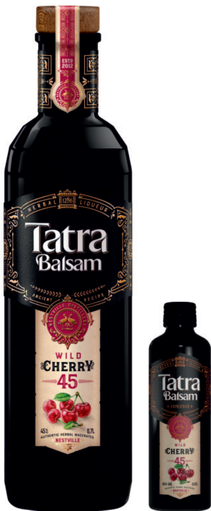
Tatra Balsam Cherry 45%