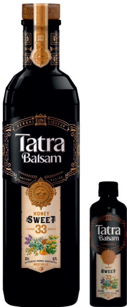
Tatra Balsam Sweet 33%