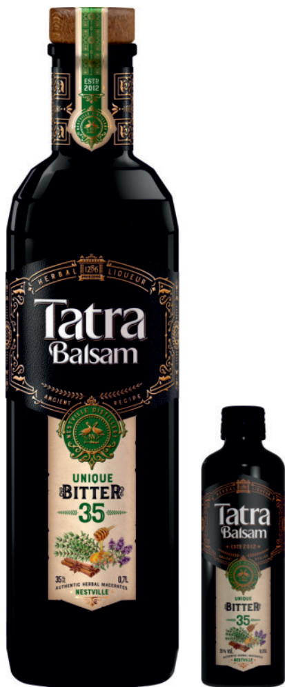
Tatra Balsam Bitter 35%