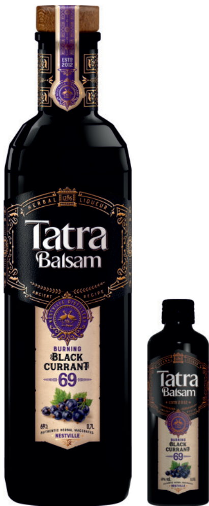
Tatra Balsam Blackcurrant 69%