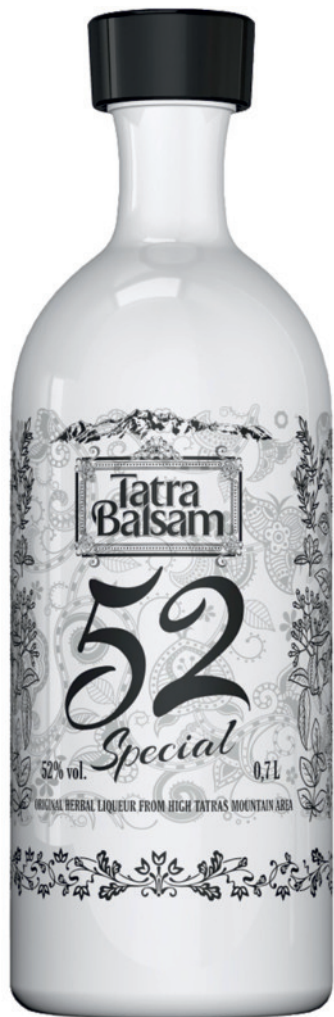
Tatra Balsam Special Ceramic 52%