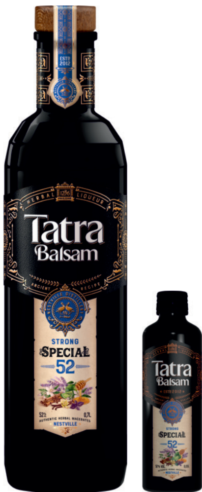
Tatra Balsam Špeciál 52%