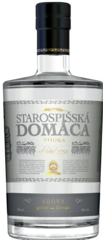
Starospišská Domáca Vodka 40%