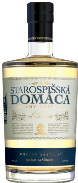
Starospišská Domáca Grain 50%