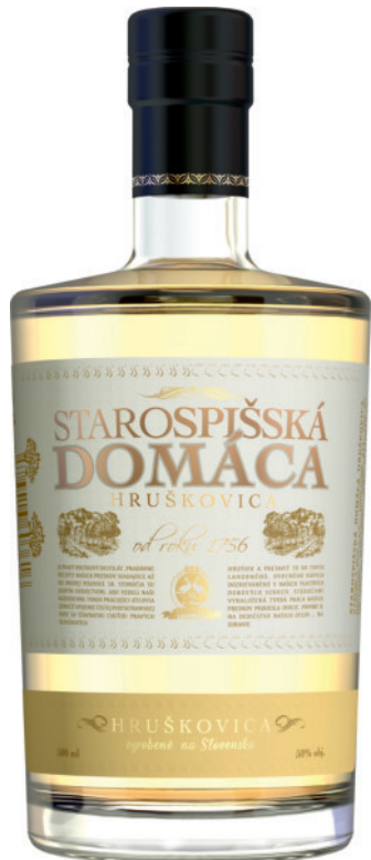
Starospišská Domáca Pear 50%