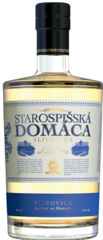
Starospišská Domáca Plum 50%