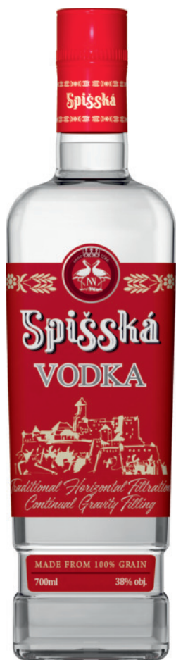
Spišská Vodka 38%