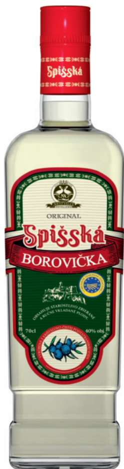
Spišská Juniper 40%