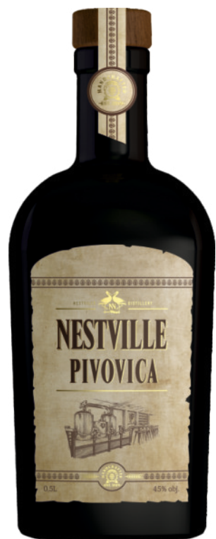
Nestville Pivovica 45%