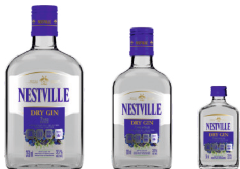
Nestville Dry Gin 37,5%