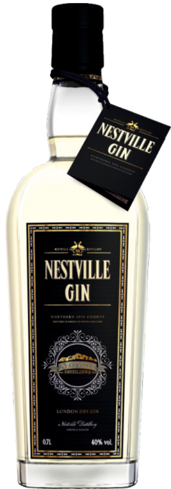
Nestville Gin 40%